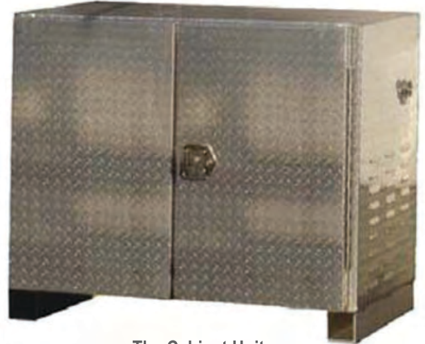
The Cabinet Unit

The entire system requires very little maintenance, involving only the periodic replacement of an air filter cartridge.